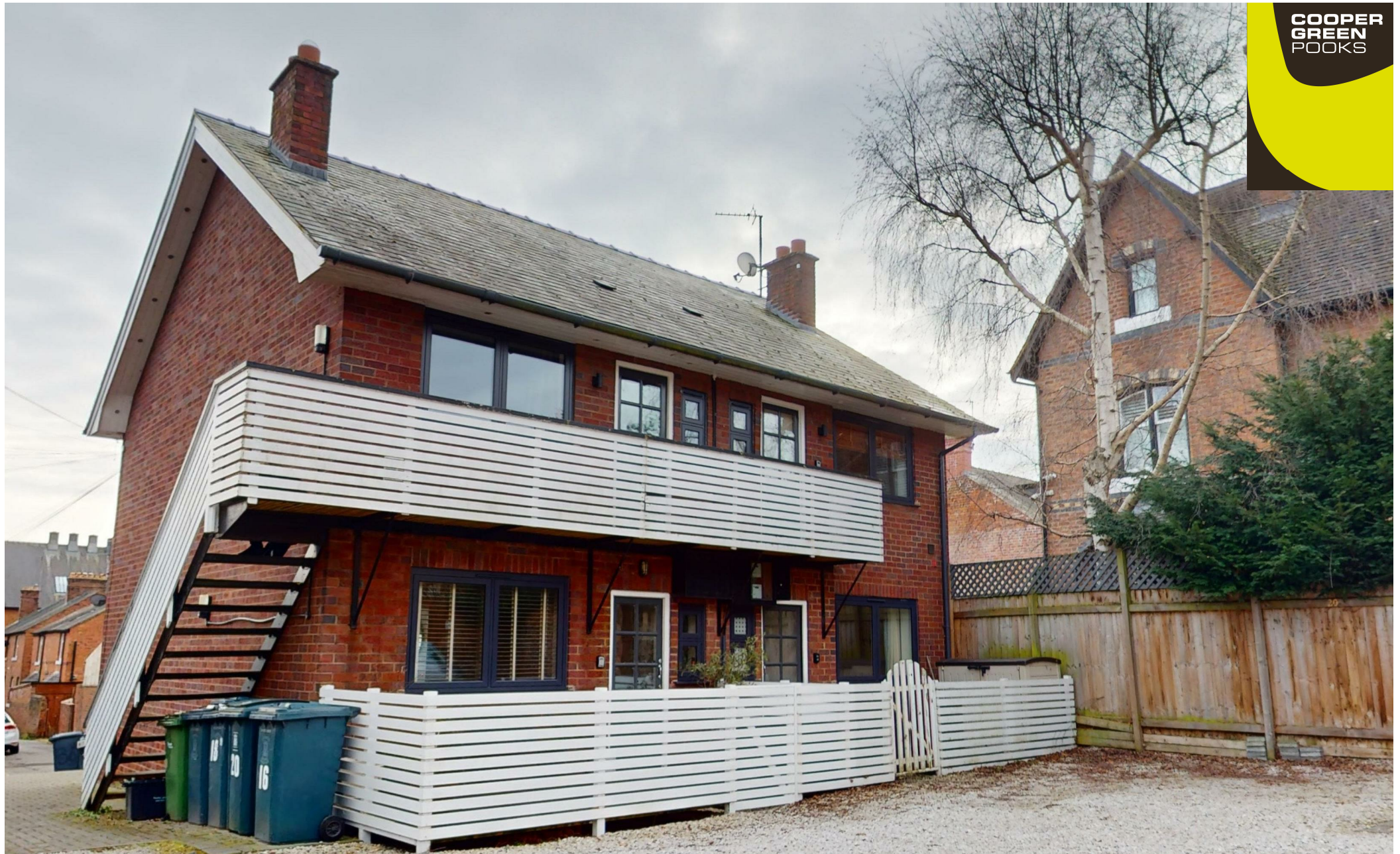
22, Longner Street, Mountfields, Shrewsbury, SY3 8QX £850 Per Month